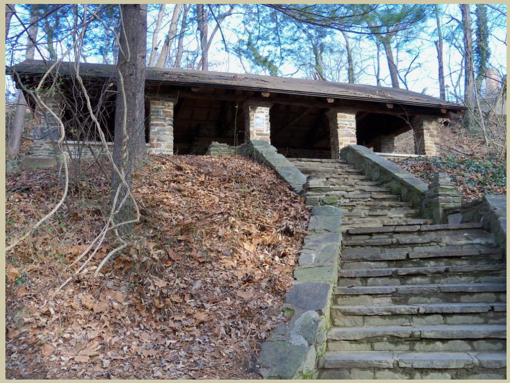
(Pavilion at Glen Woods.)

On the campus of Towson University is a natural area called "Glen Woods." The 12-acre glen has several stone structures that, when compared to the modern buildings surrounding it, seem out of place. There are two small buildings, a pavilion with a fireplace, a stone picnic table, a few outdoor cooking platforms, and various other works of masonry. Some areas of the glen have been restored, while other areas are in various states of disrepair.