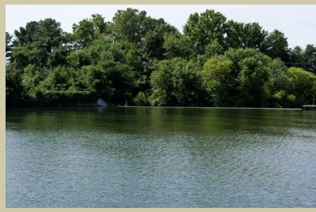
(<u>Left</u>: Workers pouring concrete for the Johnson's Pond Dam, 1936. <u>Right</u>: Johnson's Pond today. Part of the top of the dam can be seen at the far end of the pond.)

Johnson's Pond is located in Salisbury, Maryland. The dam creating the pond was built by the WPA in 1936 and is still in operation today. The pond is