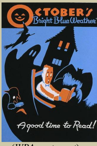
(WPA poster art)